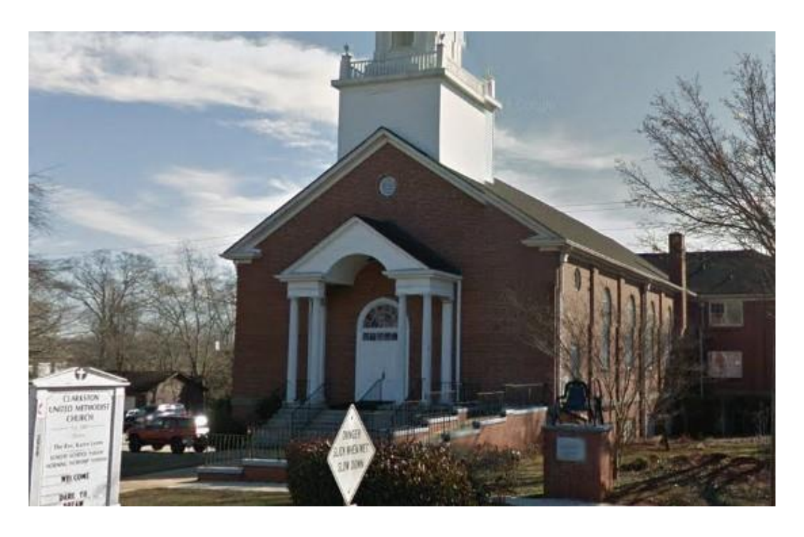
United Methodist Church Where SDA Karen Refugees Meet for Worship

With area bus lines, a railroad line passing directly through downtown Clarkston, low occupancy rates, and relatively low rental rates, Clarkston was selected as a suitable site to house / resettle refugees from overseas. Soon, through the joint efforts of the United States and the United Nations, refugees began flooding in...30,000 over the past decade.